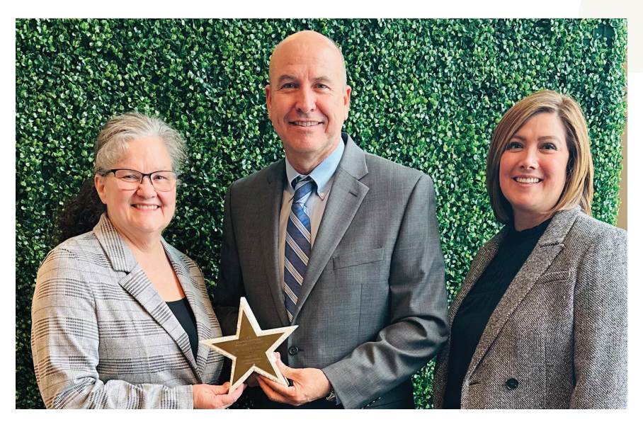
Golden Triangle Polymers' owner company Chevron Phillips Chemical received the Local Employer of Excellence award from Texas Workforce Solutions for the Local First program.