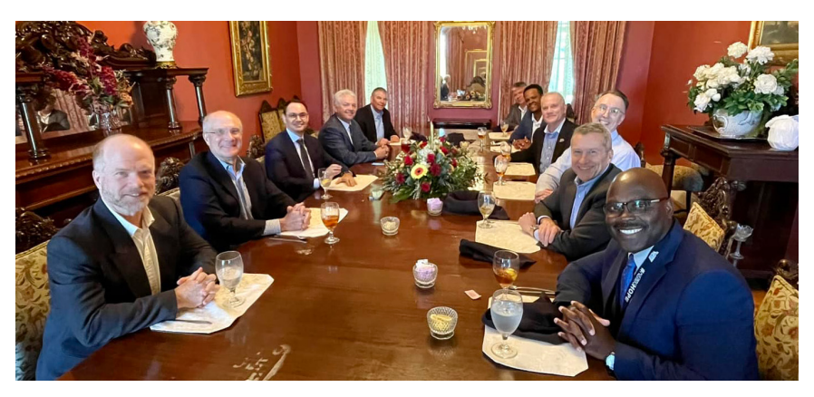
Company executives met with community leaders early in the year, including representatives from West Orange-Cove CISD, City of Orange, Lamar State College-Orange, and Orange County.