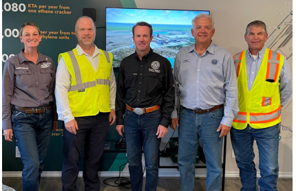
Texas Speaker of the House Dade Phelan visited the public information office and toured the construction site.