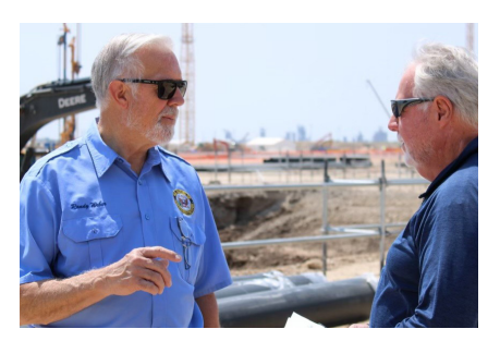
U.S. Congressman Randy Weber toured the construction site.